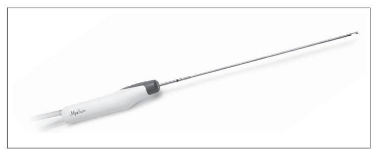
FIGURE 1. MYOSURE TISSUE REMOVAL DEVICE

The MyoSure Tissue Removal Device is shown in Figure 1. It is a hand-held unit which is connected to the control unit via a 6-foot (1.8-meter) flexible drive cable and to a collection canister via a 10-foot (3-meter) vacuum tube. Cutting action is activated by a foot pedal. The tissue removal device is a single-use device designed to hysteroscopically remove intrauterine tissue.