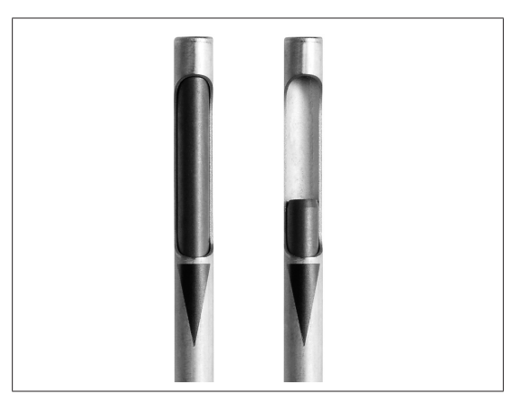
Figure 5. Closed Tissue Removal Device Cutting Window on Left

WARNING: Periodic irrigation of the tissue removal device tip is recommended to provide adequate cooling and to prevent accumulation of excised materials in the surgical site.