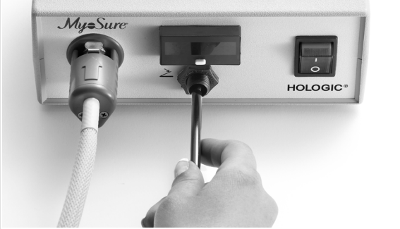
FIGURE 3. INSERT DRIVE CABLE AND FOOT PEDAL INTO CONTROL UNIT

CAUTION: DO NOT attempt to sharply bend the flexible drive cable in a diameter of less than 8 inches (20 centimeters). A sharply bent or kinked drive cable may cause the control unit to overheat and stop. During a procedure, a minimum distance of 5 feet (1.5 meters) should be maintained between the control unit and the tissue removal device to allow the drive cable to hang in a large arc with no bends, loops, or kinks.