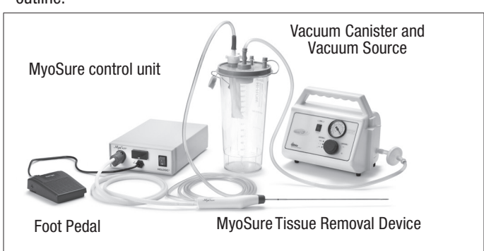
FIGURE 2. SYSTEM CONFIGURATION

1. Review the System Configuration Diagram in Figure 2 for set-up outline.