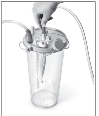
FIGURE 4. ATTACH VACUUM TUBE TO COLLECTION CANISTER

5. Non-sterile person attaches the tissue removal device vacuum tubing to the corresponding connection on the tissue trap of the collecton canister as shown in Figure 4.