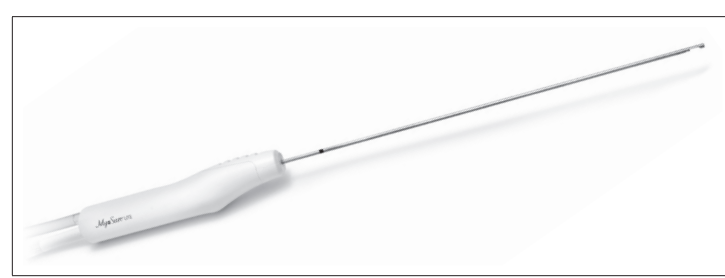
FIGURE 1. MYOSURE® LITE TISSUE REMOVAL DEVICE

The MyoSure LITE Tissue Removal Device is shown in Figure 1. It is a hand-held unit which is connected to the control unit via a 6-foot (1.8-meter) flexible drive cable and to a collection canister via a 10-foot (3-meter) vacuum tube. Cutting action is activated by a foot pedal. The tissue removal device is a single-use device designed to hysteroscopically remove intrauterine tissue.